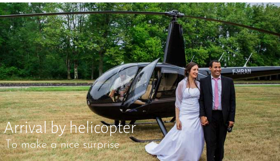
Arrival by helicopter To make a nice surprise