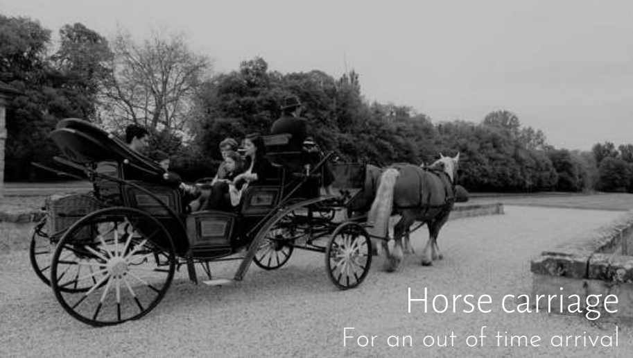
Horse carriage For an out of time arrival