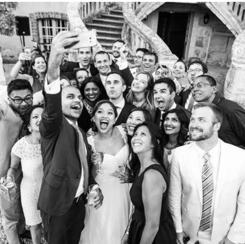
Photo and video memories

The florist will transform your ideas into beautiful flower laden arrangements for your wedding.