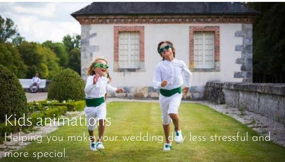
Kids animations Helping you make your wedding day less stressful and more special.